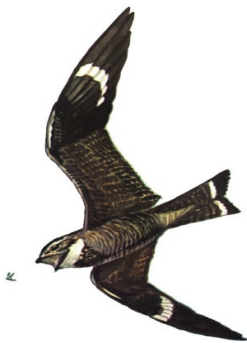
Nighthawk in flight