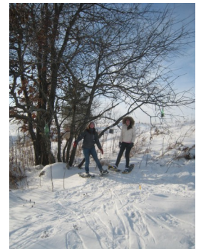
T.C.S. hard at work

The students first day was spent touring the Black Oak Savanna on snowshoe. Thanks to Ganaraska Forest Centre for the generous snowshoe loan! We moved debris off the trail and collected saplings for the next day's construction project, and learned about fire ecology and tallgrass restoration methods. The second day narrowed the focus to more closely examine grassland bird species on the Rice Lake Plains. The students constructed bird feeders to be placed by the large south-facing windows and along the trails behind the ecology centre. A few of the students were keen to take a mentoring role for students at the TCS Junior School. These students will be educating their younger counterparts on grassland bird ecology. The third day was spent removing dogwood to create habitat for small rodents as well to allow more sun to