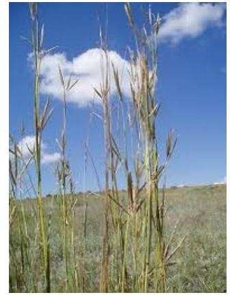
Turkey Foot can reach a height of 10 feet