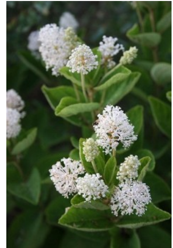
New Jersey Tea in bloom

New Jersey Tea is an attractive small rounded woody shrub with small plumes of fluffy white flowers that bloom in early to mid-summer. Its versatile showy flowers are attractive in the prairie, savanna, and woodland, which are its home. This plant has a unique leaf-vein structure and the leaves are opposite or alternate, small (typically 1–5 cm long), simple, and mostly with serrated margins. The leaves have three very prominent parallel veins extending from the leaf base to the outer margins of the leaf tips and the leaves are ovate in shape. The leaves also have a shiny upper surface that feels "gummy" when pinched between the thumb and forefinger. The flowers are white, greenish-white, blue, pale purple or pink, maturing into a dry, three-lobed seed capsule. The flowers are tiny and produced in large, dense clusters that are reported to be intensely fragrant, and are said to resemble the odor of "boiling honey in an enclosed area. The seeds of this plant can lie dormant for hundreds of years, and Ceanothus species are typically dependent on forest fires to trigger germination of its seeds.